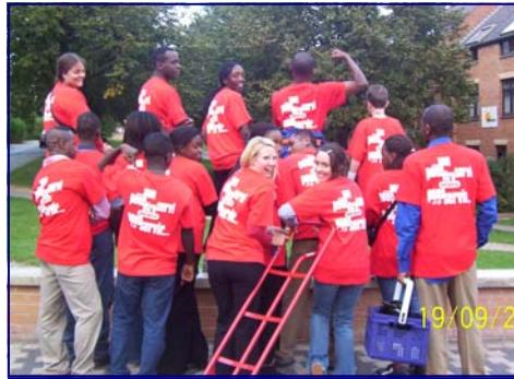
Here's the group that helped students move in at the beginning of the semester. The back of the shirt reads, "Not to be served but to serve."