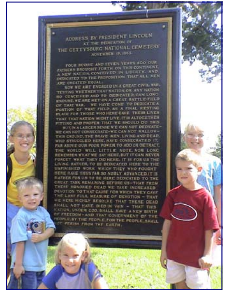
In front of the Gettysburg Address display in the cemetery of Shiloh National Park. The girls had a good review of reciting it (mostly) from memory after learning it a few years ago.