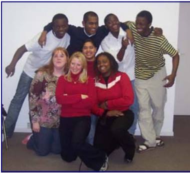
These guys had a great Alpha weekend retreat. Everyone who went "can't wait till the next one."

Meanwhile, back in Belgium, the SFC ministry is continuing just fine without us. That's the goal, isn't it? We are astounded at the regular reports we are getting back from SFC leaders of new visitors and students coming to faith in Christ. Activities in which God has used SFC students this semester include (but are definitely not limited to) the 24-hour bike race, a missions trip to serve the Chi Alpha at ULL, the annual SFC-Belgium retreat, and others shown below. We are anticipating planting more groups and seeing other new doors open up as God enables us to pass the baton of leadership to gifted students and workers.