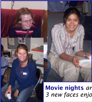
Movie nights are always a hit with college students. Here are 3 new faces enjoying the fun, food and discussion.