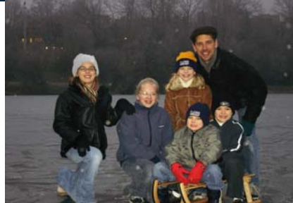
Enjoying a first frozen lake experience