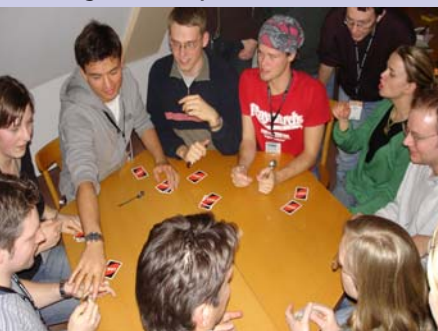
Building community at the ESC conference