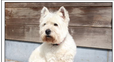
“Farewell to Sadie” 2006-2021 She will be missed!