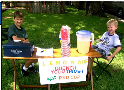
Stirring their entrepreneurial lemonade juices in the hot & humid LA summer