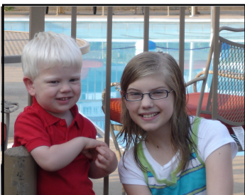
discovering an OUTDOOR pool